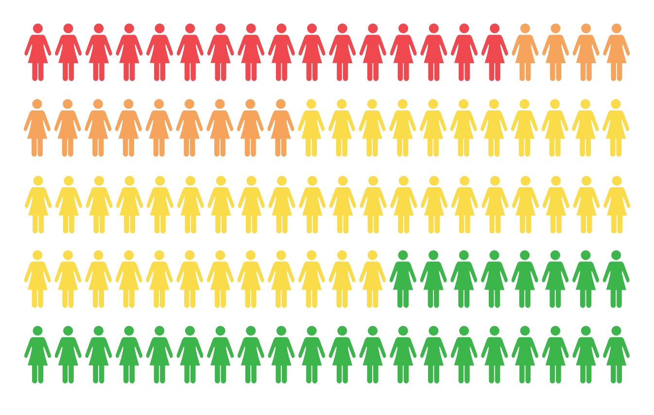
Too many study participants have high mercury or low omega-3s