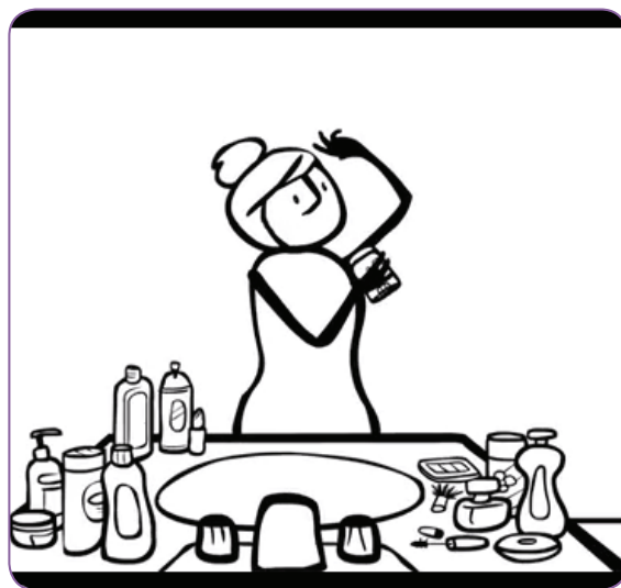
In 2010 The Campaign released The Story of Cosmetics . This short film illustrates the ugly truth about "Toxics In, Toxics Out." It has been viewed more than 850,000 times since its release.

products to buy. Skin Deep ranks more than 69,000 cosmetic products using the best available science from government and academic sources about chemical hazards. Consumers are now actively researching information about products rather than being passive observers of the advertising strategies that worked so well in the past. Consumers' increasing use of Skin Deep to find safer products also shows a growing understanding that government is not adequately regulating this industry to ensure that cosmetics and personal care products do not contain harmful chemicals.