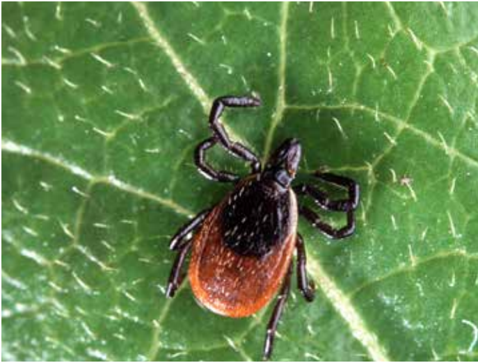
Adult deer tick, Ixodes scapularis .

Rocky Mountain spotted fever can cause fever, headache, vomiting, muscle pain and in some cases death. It can be transmitted to humans by bites of the American dog tick, Rocky Mountain wood tick and brown dog tick. The disease has been reported throughout the lower 48 states; most cases occur in North Carolina, Oklahoma, Arkansas, Tennessee and Missouri. The incidence rate has increased over the past 20 years to about 2,000 cases annually. But the fatality rate has greatly decreased over the past 50 years from 5 to 10 percent to less than 0.5 percent (CDC 2012A).