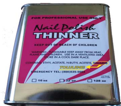
Figure 1. Toluene was listed on the ingredient panel of a thinner

Nail salons typically use 0.5 fluid ounce bottle of products for multiple applications. Repeated openings of the bottles allow volatile chemicals such as solvents to evaporate resulting in undesirable product consistency. A common practice among nail technicians is to add thinners to maintain the consistency of the polishes to aid application and to ensure a satisfactory finish. During sampling, staff observed toluene on the ingredient panel of a nail polish thinner (Fig. 1). Therefore, two thinners were collected for analysis. A sampled container of thinner is shown in Fig. 1 (NPR-0517-H); the other thinner (NPR-0518-A) did not have an ingredient panel.