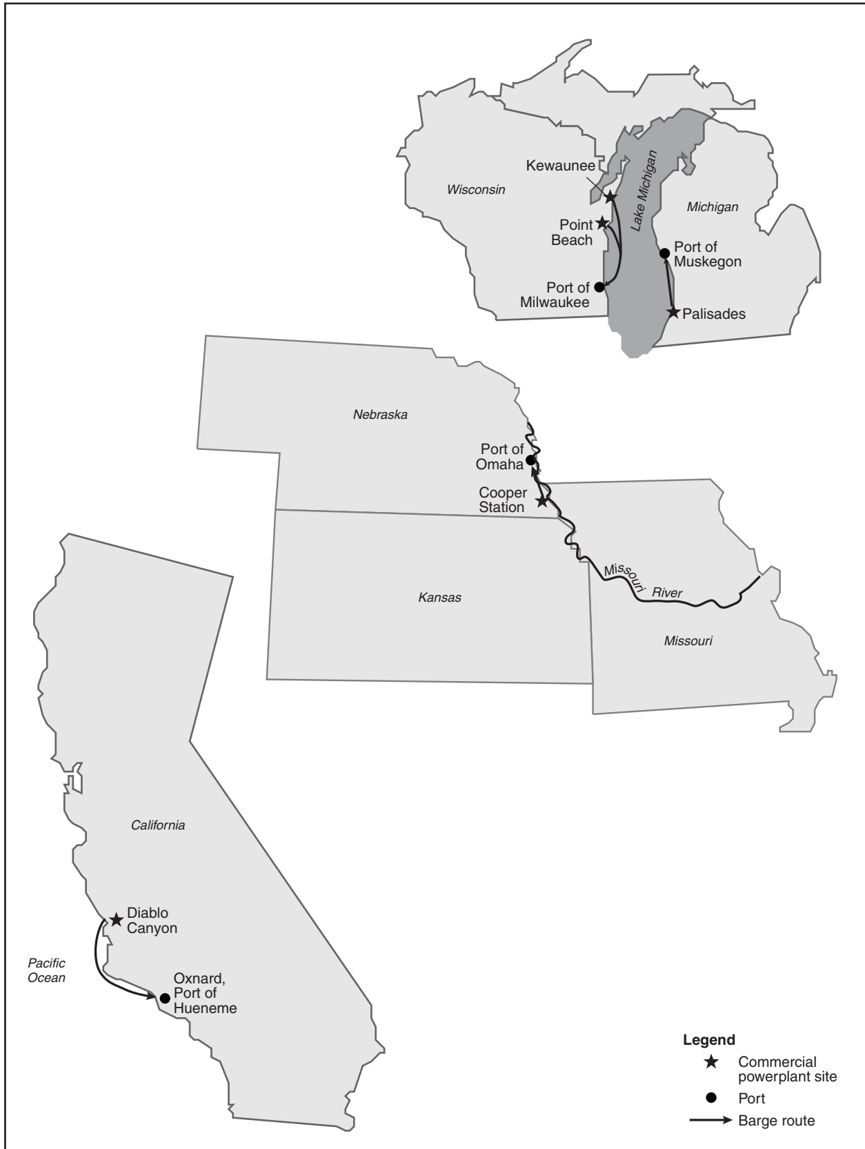
Figure J-9. Routes analyzed for barge transportation from sites to nearby railheads (page 3 of 4).